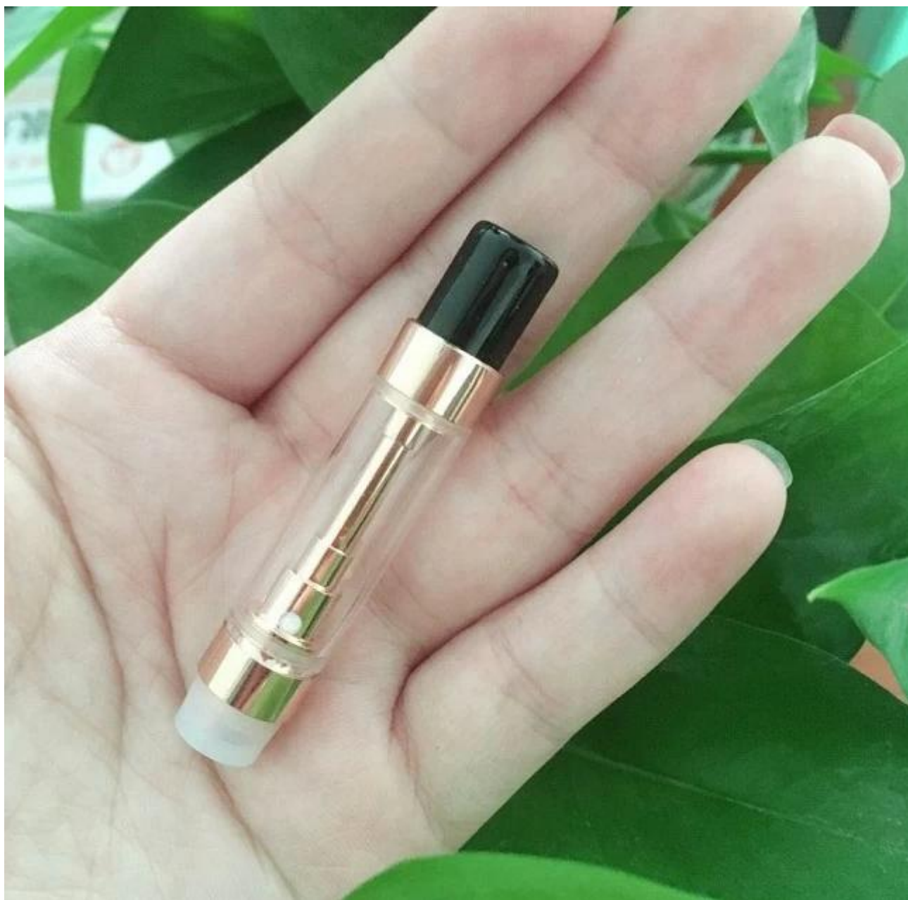
Rose Gold CBD THC Oil Vape Cartridge with newest ceramic technology